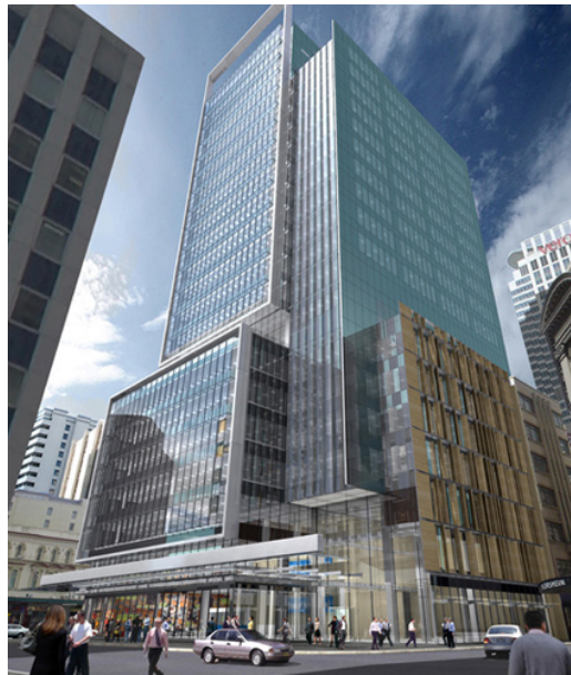
Bostik MS Safe Fix was used on 80 Queen Street (above) which achieved a NZ Green Building Council, 5 Green Star – Office Design.

This Appraisal replaces BRANZ Appraisal No. 662 [2016]