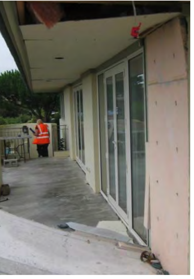
The connections failed on this precast concrete panel.

6.2.3 Good roof and floor design generally hold the building together, but BRANZ observed damage to roof valleys where roof shapes were complex.