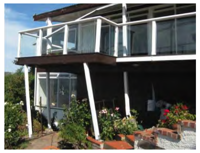
There were many examples of ground slumping/sliding affecting houses.