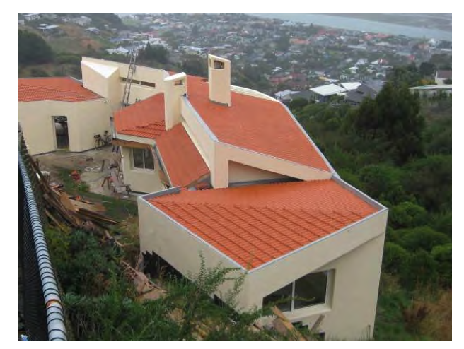
Plan irregularity increases the risk of damage.

6.1.2 The increased complexity comes from the fact that hillside homes are often outside the scope of NZS 3604 Timber-framed buildings – specific engineering design is often required. There may be split levels, plan irregularity and vertical irregularity. These houses can involve a mix of structural systems and stiffness.