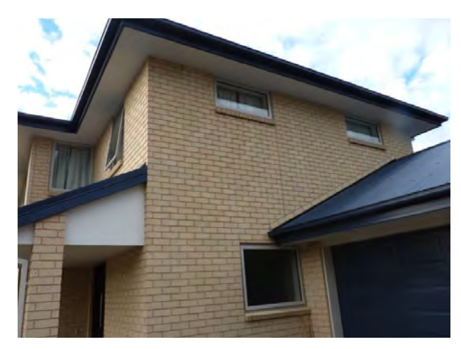
Careful design and construction meant this 2 storey masonry veneer house performed well, with only minor damage inside.

2.0.2 Modern buildings generally satisfied these objectives considering the level of shaking.