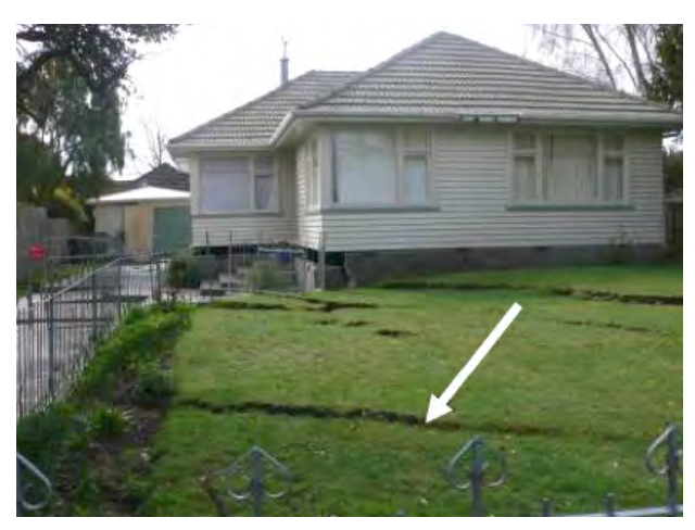
Lateral spreading is clearly visible in the grounds around this house.

4.0.1 How much the ground shakes at a particular location depends on how far it is from the epicentre of the earthquake and the type of ground below the site: