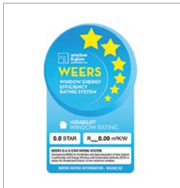
Figure 3. A WEERS label shows the thermal performance of windows.

4.0.1 BRANZ and the Window and Glass Association New Zealand developed a scheme called the Window Energy Efficiency Rating System (WEERS). It combines the thermal performance of the frame and glazing together with window size to calculate the specific thermal performance for any window. Window suppliers can use this to calculate the thermal performance of windows for housing [Figure 3]. Some window suppliers provide a WEERS certificate that records the R-value of each window and the R-value for the house/lot. WEERS implements the international standard ISO 10077-2:2018 Thermal performance of windows, doors and shutters – Calculation of thermal transmittance – Part 2: Numerical method for frames . The calculation used by WEERS is consistent with the H1/VM1 window construction calculation methodology.