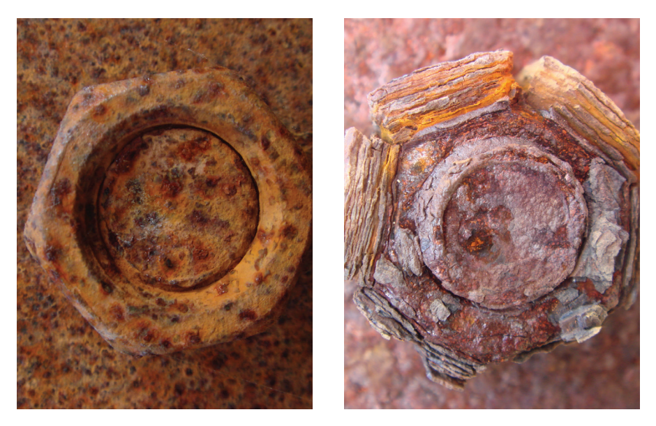
Figure 1. Mild steel nuts after 3 years' exposure to a rural atmosphere (left) and a severe marine atmosphere (right).

NZS 3604:2011 Timber-framed buildings has exposure zone (atmospheric corrosivity) maps dividing New Zealand into zones B, C